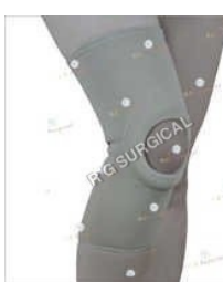
Patella Knee Cap With Gel Ring