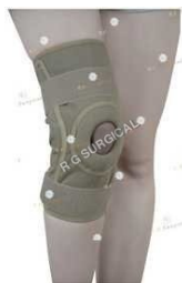
Functional Knee Support