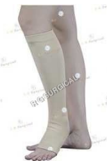
Varicose Below Knee