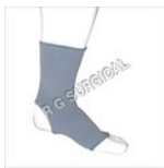
ELASTIC ANKLE SUPPORTS

Abdominal Binder Ultima, Ankle Binder, Ankle Support 3d, Arm Sling Air, Arm Sling Baggy, Arm Strap, Abdominal Belt, Abdominal Binder Popular, Abdominal Binder Popular a-12, Abdominal Binder Ultima, Ankle Binder, Ankle Brace, Ankle Splint, Ankle Splint Support, Ankle Support 3d, Etc.