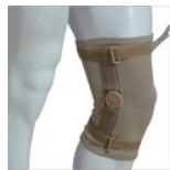
Hinged Knee Supports