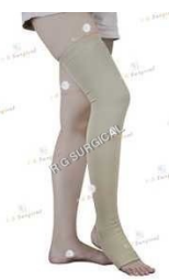
Varicose Above Knee