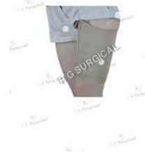
Thigh Band Support