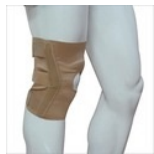
Elastic Hinged Knee Support