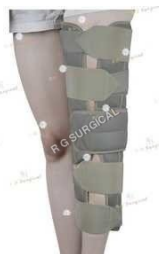
Knee Gaiter Supports