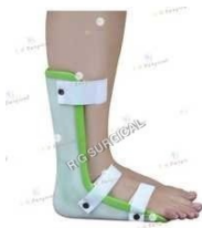
Foot Drop Support