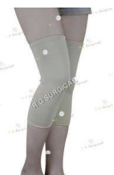
Knee Cap Support