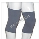
Knee Support Four Way