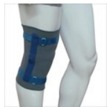
Hinge Knee Support