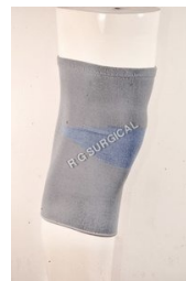
Knee Cap 3D